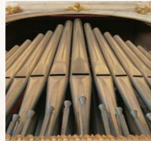
PIEVE Church of San Floriano Organ Gaetano Callido e figli, 1812