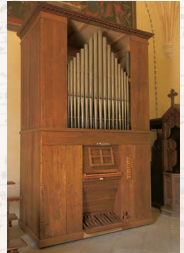
DONT Church of Santa Caterina d'Alessandria Organ of anonymous, circa 1550-1560